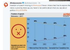
Chart of the month

Have considered emigration | by socio-demographic group | Nigeria | 2017