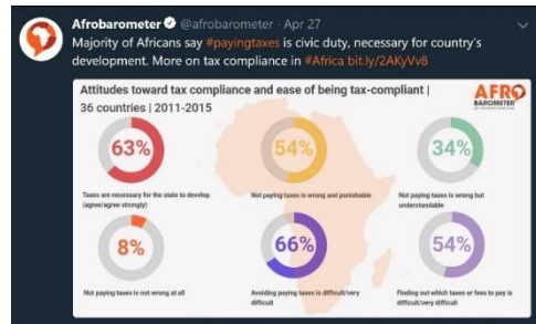
Chart of the month

Fear and experience of violence | Nigeria | 2017