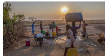
Analysis | African nations are among those most vulnerable to climate change. A new survey suggests... @washingtonpost.com