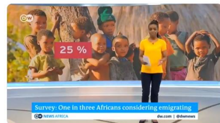
Chart of the month

Cameroon is a democracy | anglophone vs. francophone citizens in Cameroon | 2013-2018