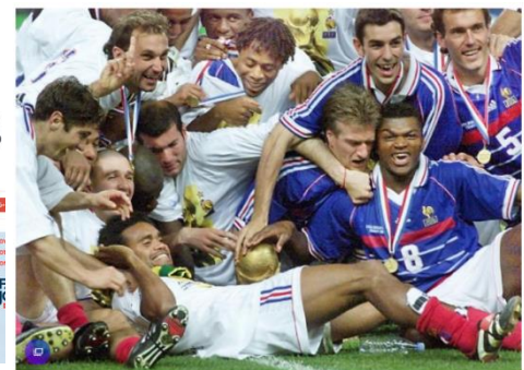
France's World Cup-winning side in 1998 were held up as a model of racial integration at a time of tensions about immigration

Afrobarometer Retweeted allAfrica.com @allafrica - Jul 4 African Migration - Who is Thinking of Going Where. And Why - surveys by @afrobarometer allafrica.com/view/group/mal... #Africa #Benin #Ivorycoast #Ghana #Kenya #Malawi #Mali #Migration