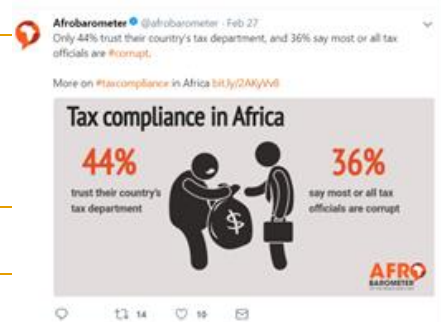
Chart of the month