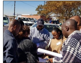
The Botswana team looks over its maps and practices interviewing before heading into the field.